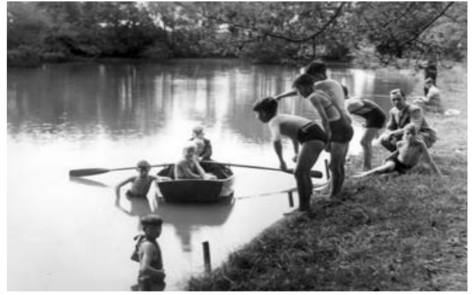
Taking a dip

The above show exactly the sort of life awaiting children when they leave the dangers of the city behind. Thousands of children have already been evacuated to the safety of the Great British countryside.