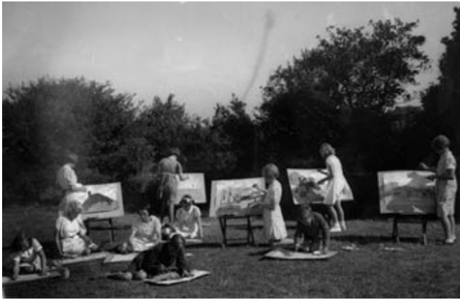
Art Class in the country